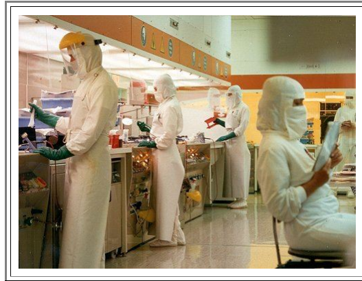
General view of work in a clean room