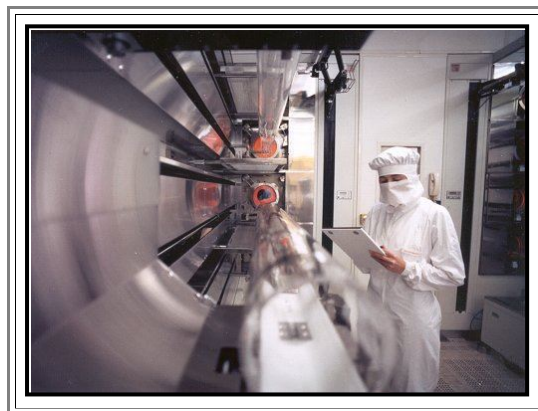
Looking along the mechanism for moving wafers into a furnace. The orange glow from the furnace tubes is visible.