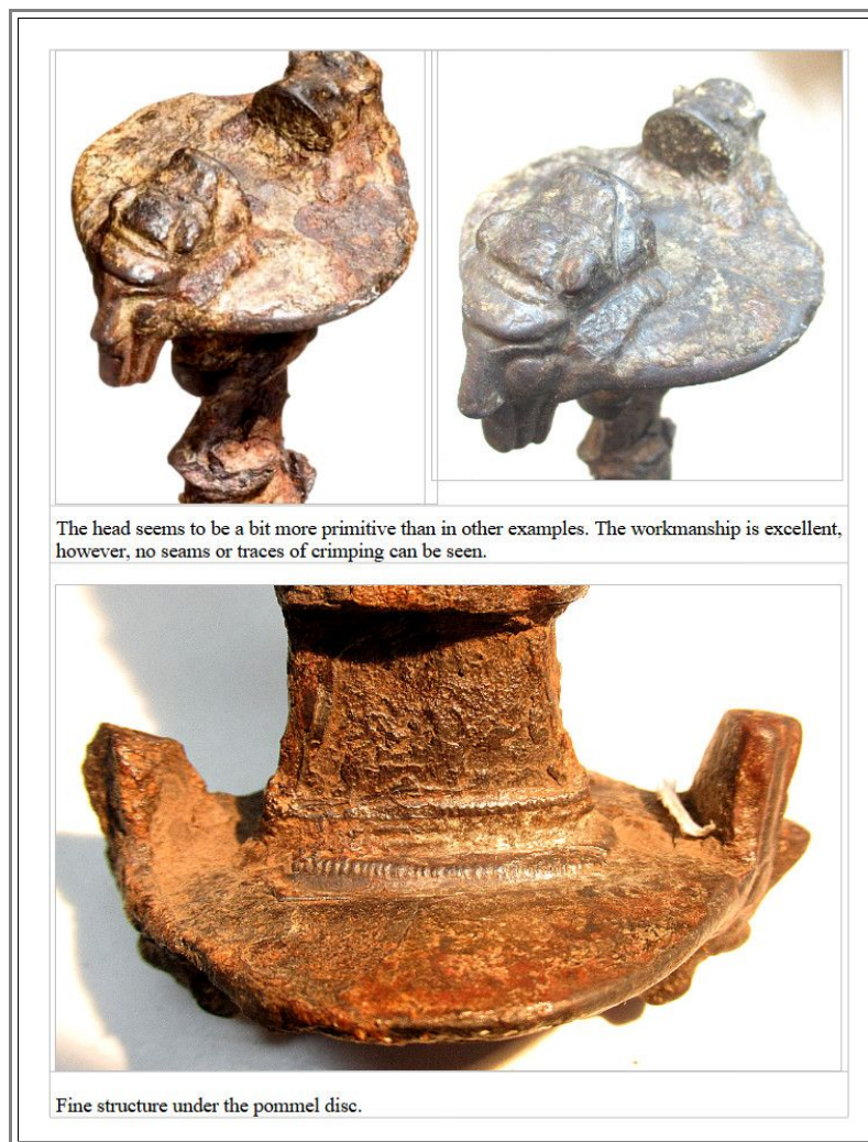
Details IMAS 3

IMAS 3 is considerably longer than INAS 1 – 53 cm compared to 49 cm. It is heavily corroded but one of the heads is relatively well preserved.