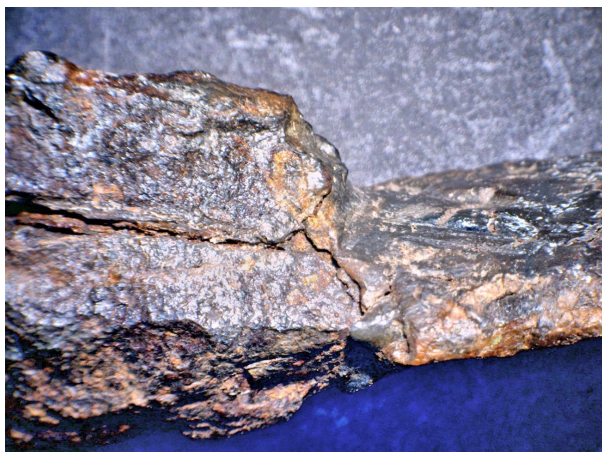
Looking sideways at the juncture blade - grip.