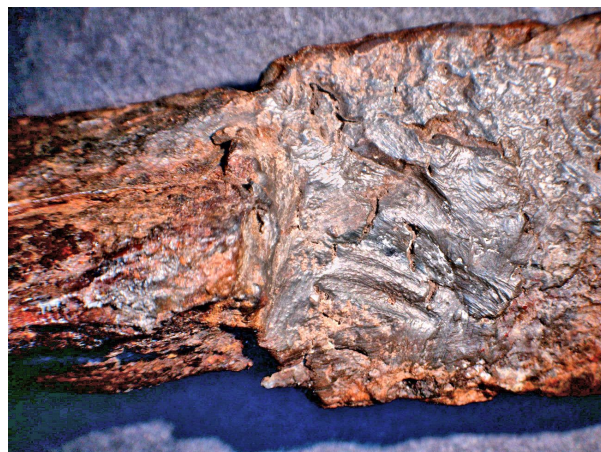
Looking "flat" on the blade where it joins the grip with the "smeared" iron