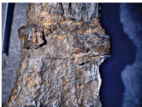
The two rings are done in a "ring crimped into a base ring" but they are rather corroded.