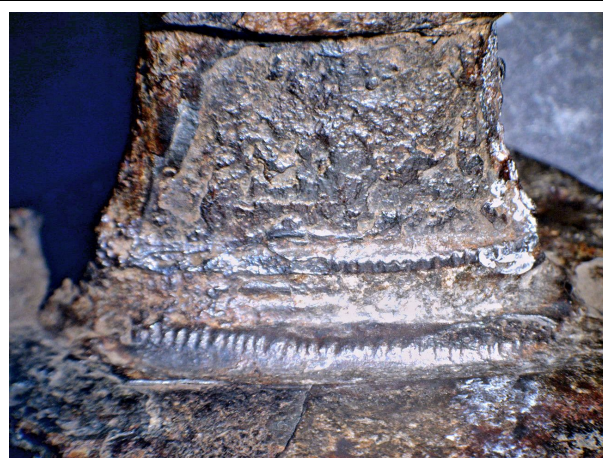
The underside of the top plate has some decorations but not as elaborate as IMAS 1