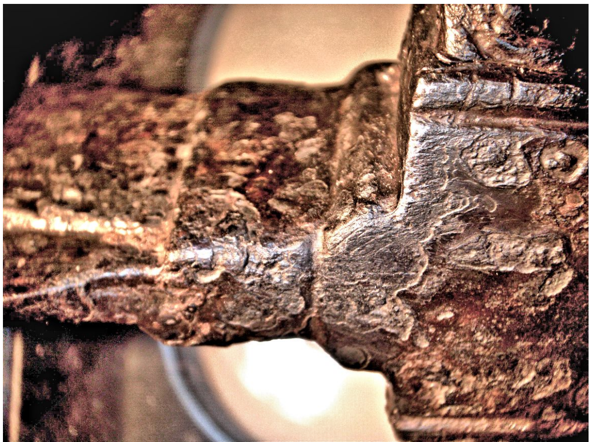
Connection of blade to hilt