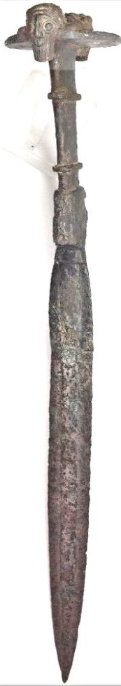
The break in the blade is hardly visible