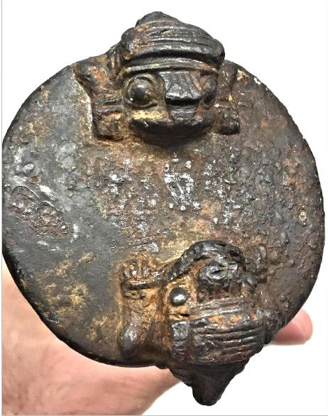
The other head and the animals attached to the heads