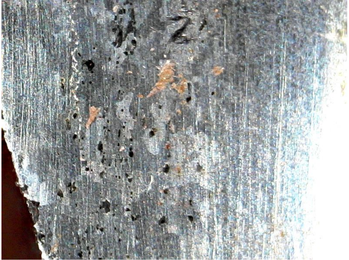
Bad picture but hints at “bad” iron inside and laminated construction.