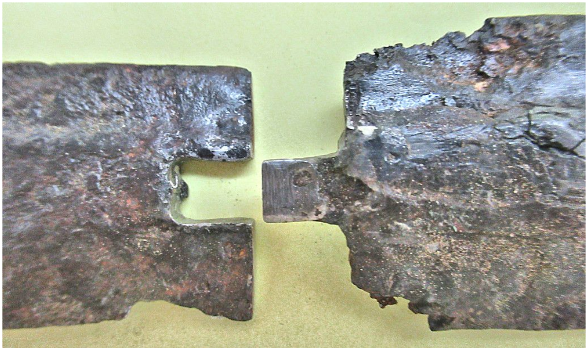
Break with attempt to repair. Hand-polished left part