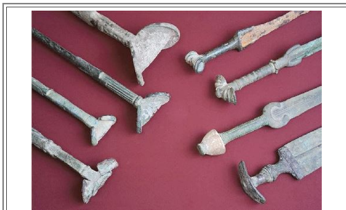
Formerly highly esteemed bronze swords are now faked "pastes"