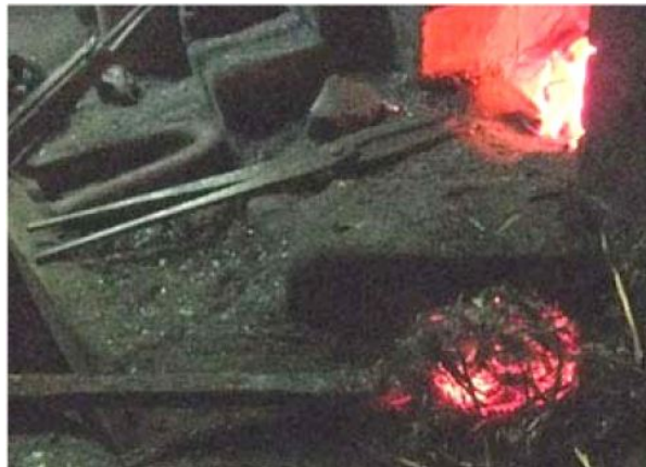
Putting rice straw on the steel to be folded Nice trick. But what does it do?