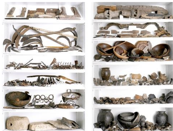
La Tène finds besides swords