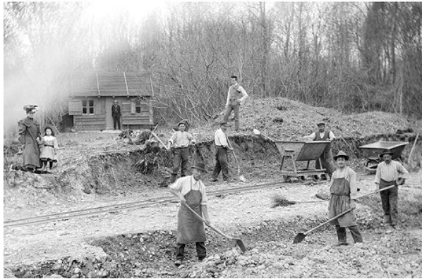
Serious digging in La Tène