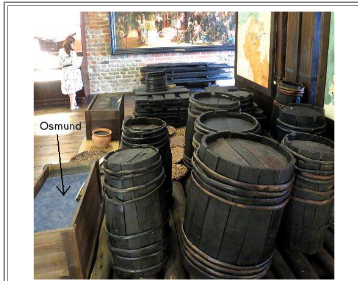
Barrels from the copper ship" and the box of "Rudna Zelazna (Osmund)"